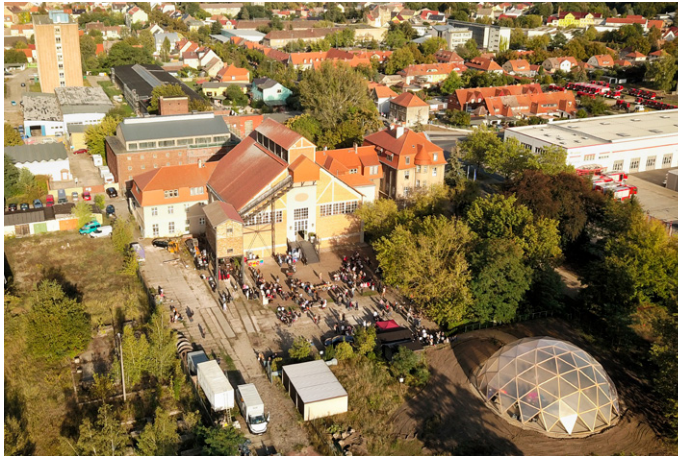
E-WERK Luckenwalde aerial photograph, 2019.