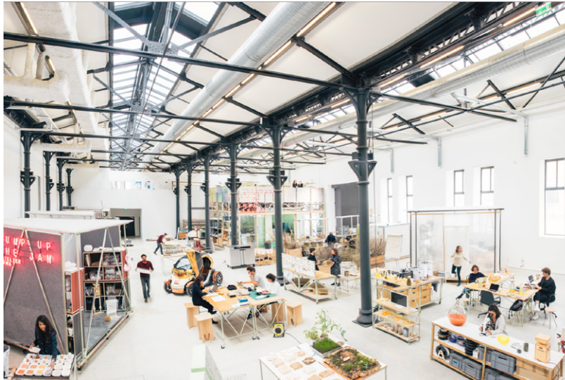
Atelier LUMA.